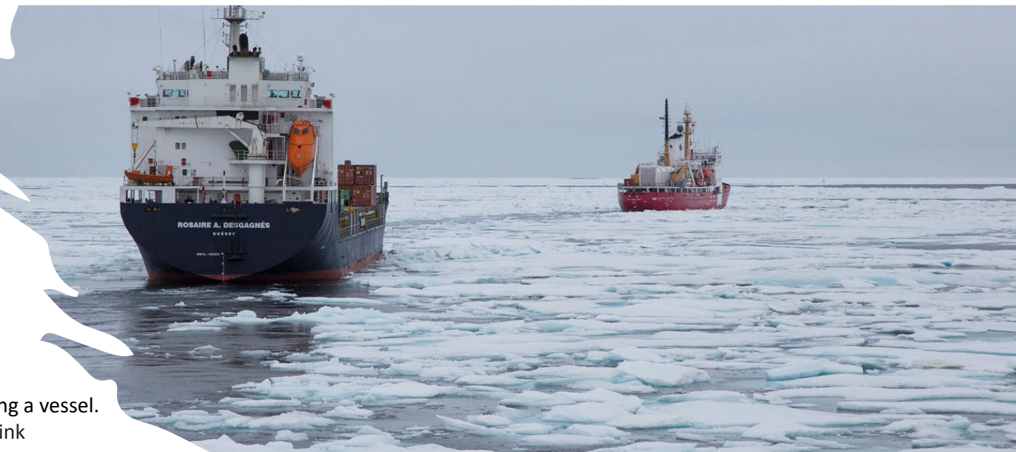
Type 1200 "R" Class icebreaker escorting a vessel.