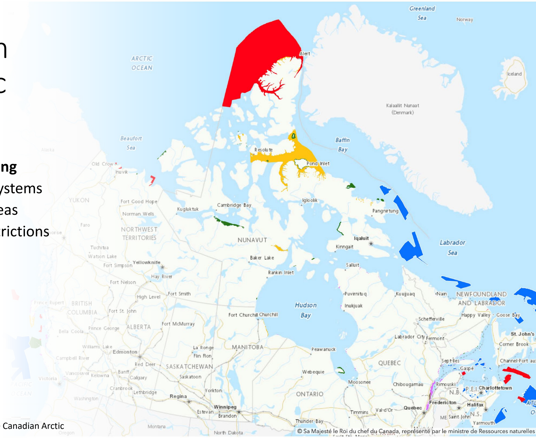
Example of Marine Protected Areas in the Canadian Arctic