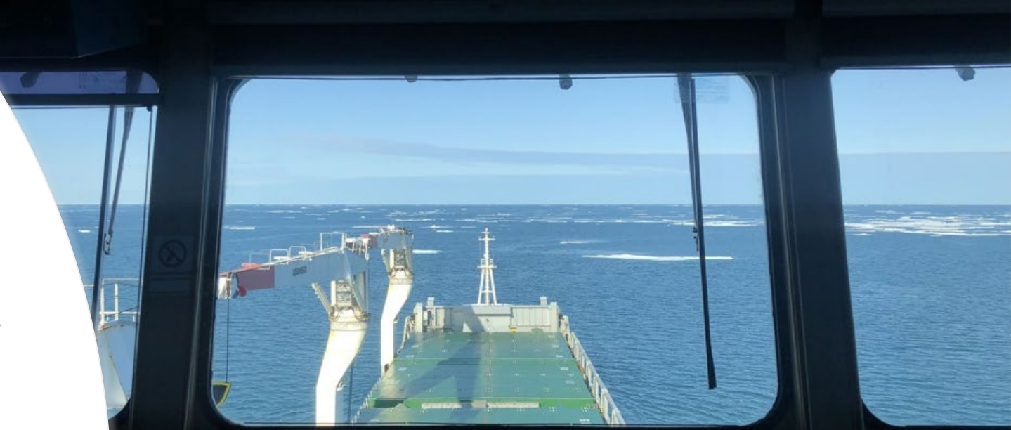
Cargo Transit through NWP by Amazoneborg (Baltic 1A ~ PC7).