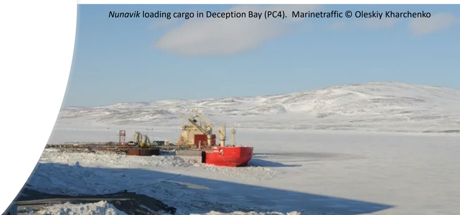
Nunavik loading cargo in Deception Bay (PC4).